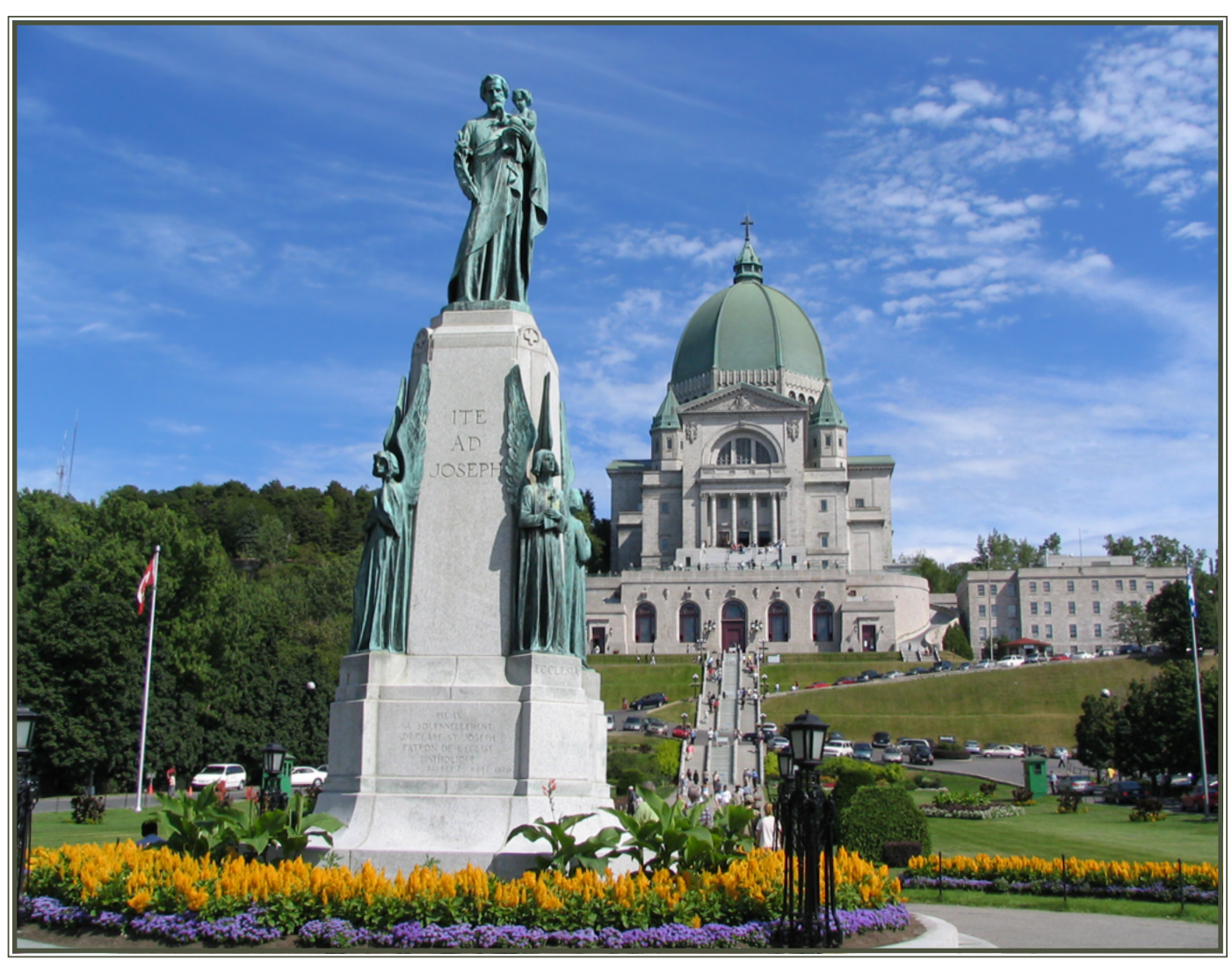
Saint Joseph's Oratory, Montreal