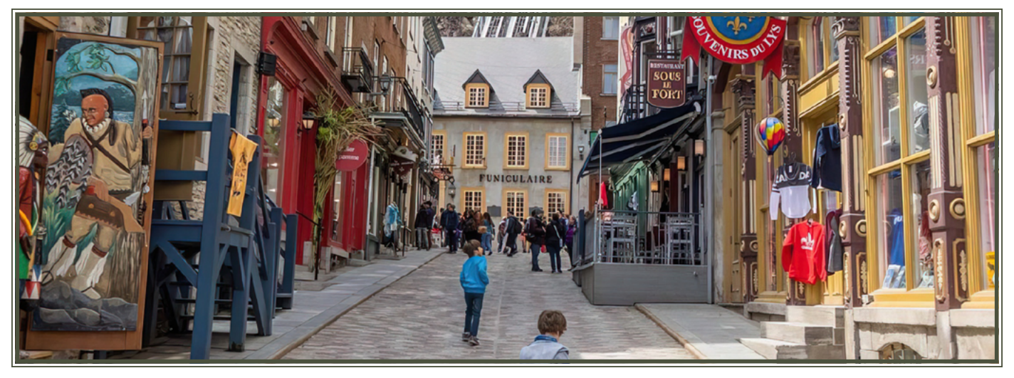
The streets of Quebec City