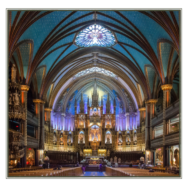
The Basilica of Notre-Dame of Montreal, mere footsteps from our hotel.

Train time! This morning we'll travel by Canadian Rail down the Saint Lawrence River to Montreal – the city Mark Twain named "The City of 100 Bell Towers." Breakfast will be available on board while the resplendent fall foliage – at its peak! –