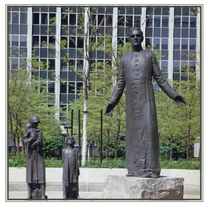
International head quarters of the Knights of Columbus, where we'll also see the tomb of Blessed Michael McGivney