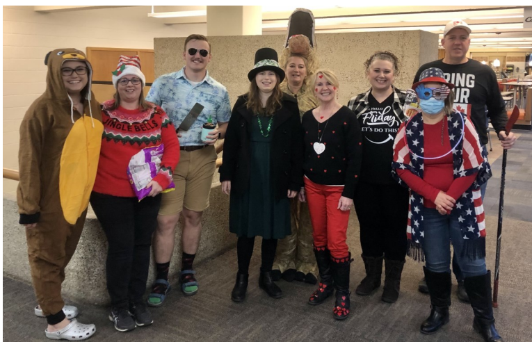
The Student Success Center Staff celebrated Halloween with an open house lunch for students. The staff dressed up as different holidays. Dino-saur Day was even represented.