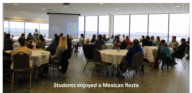
Students enjoyed a Mexican fiesta