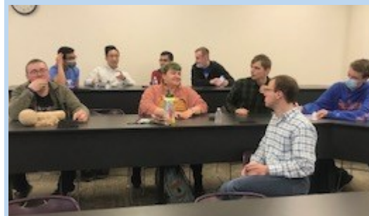
A group of students strategizing answers for Jeopardy.

A fun game of Jeopardy was held on March 29 and March 30 to sharpen students' skills on Financial Literacy.