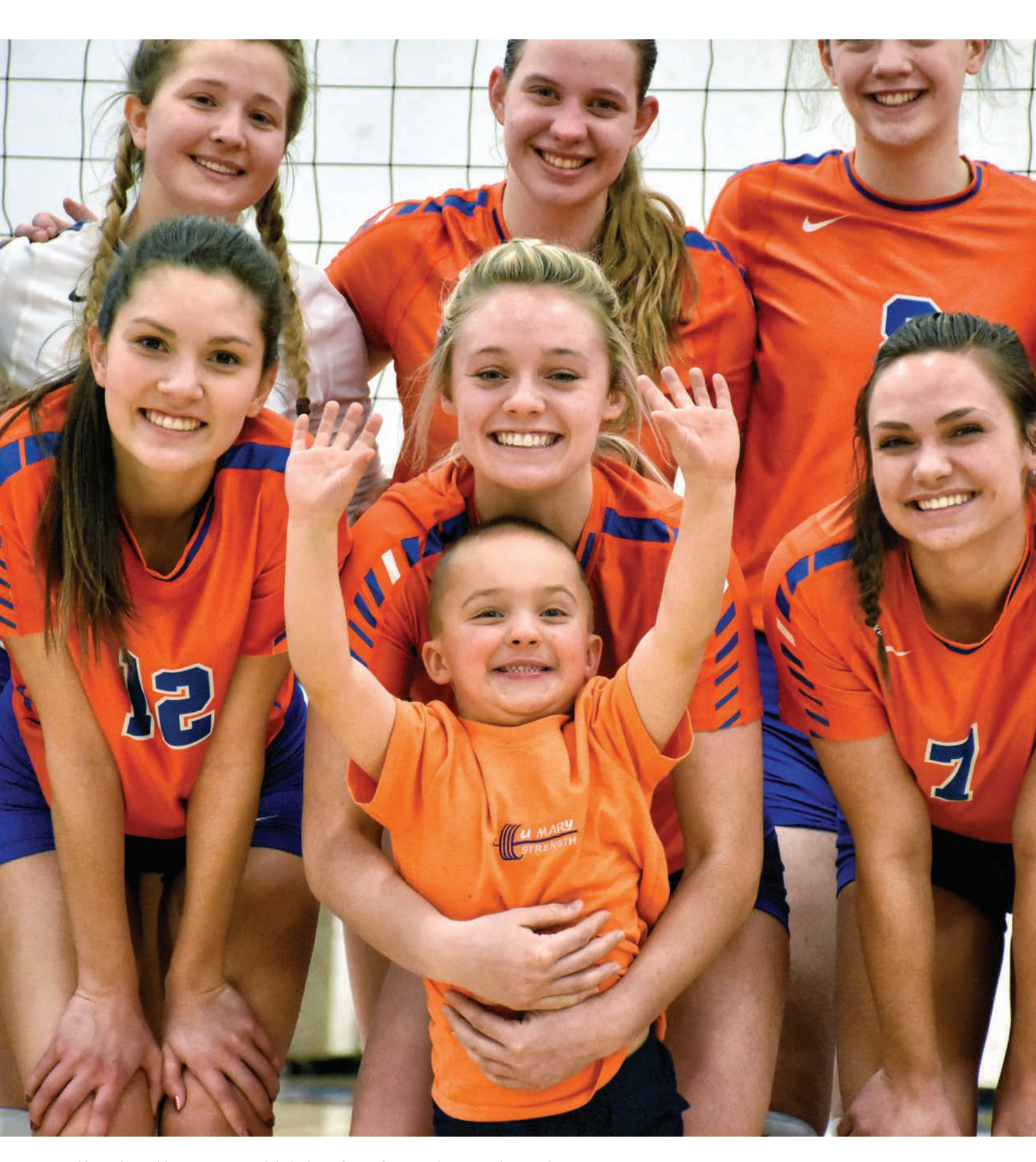
Marauders athletes connect with kids through coaching youth, mentorships and community service, Special Olympics, Wheels in Motion and more.